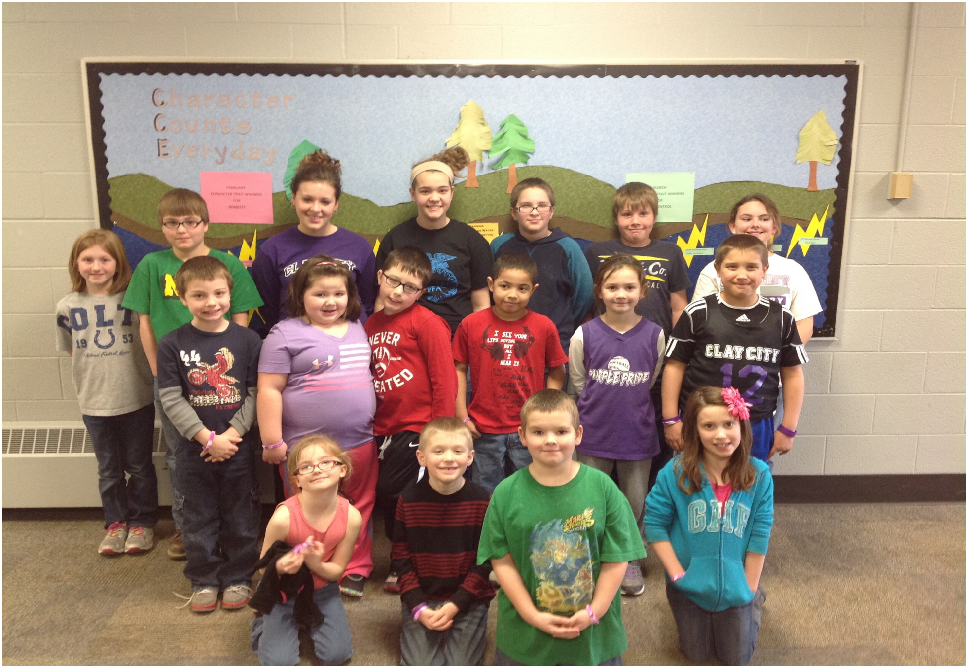
February Character Trait Winners Honesty