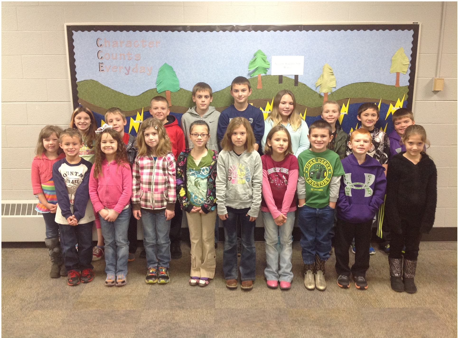
November Character Trait Winners Respect