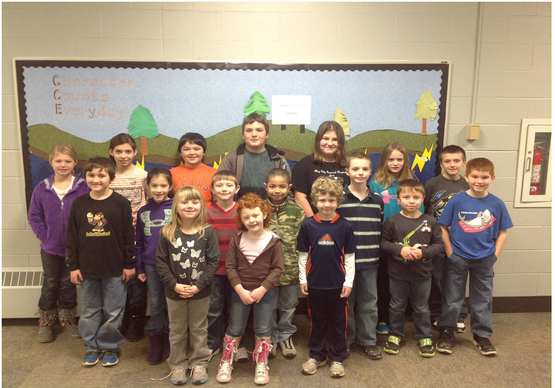
December Character Trait Winners Courtesy