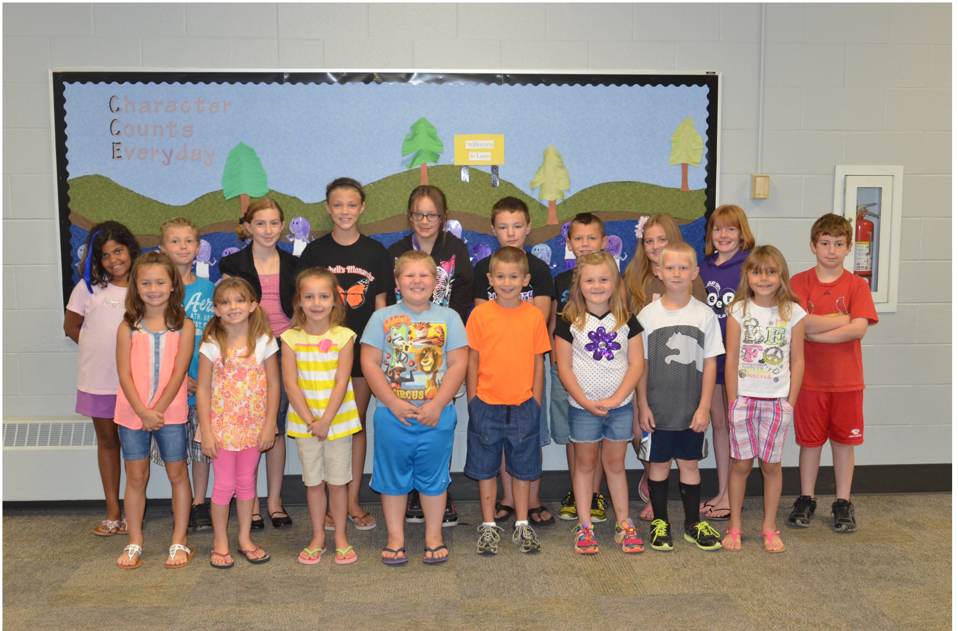
August Character Trait Winners Willingness to Learn