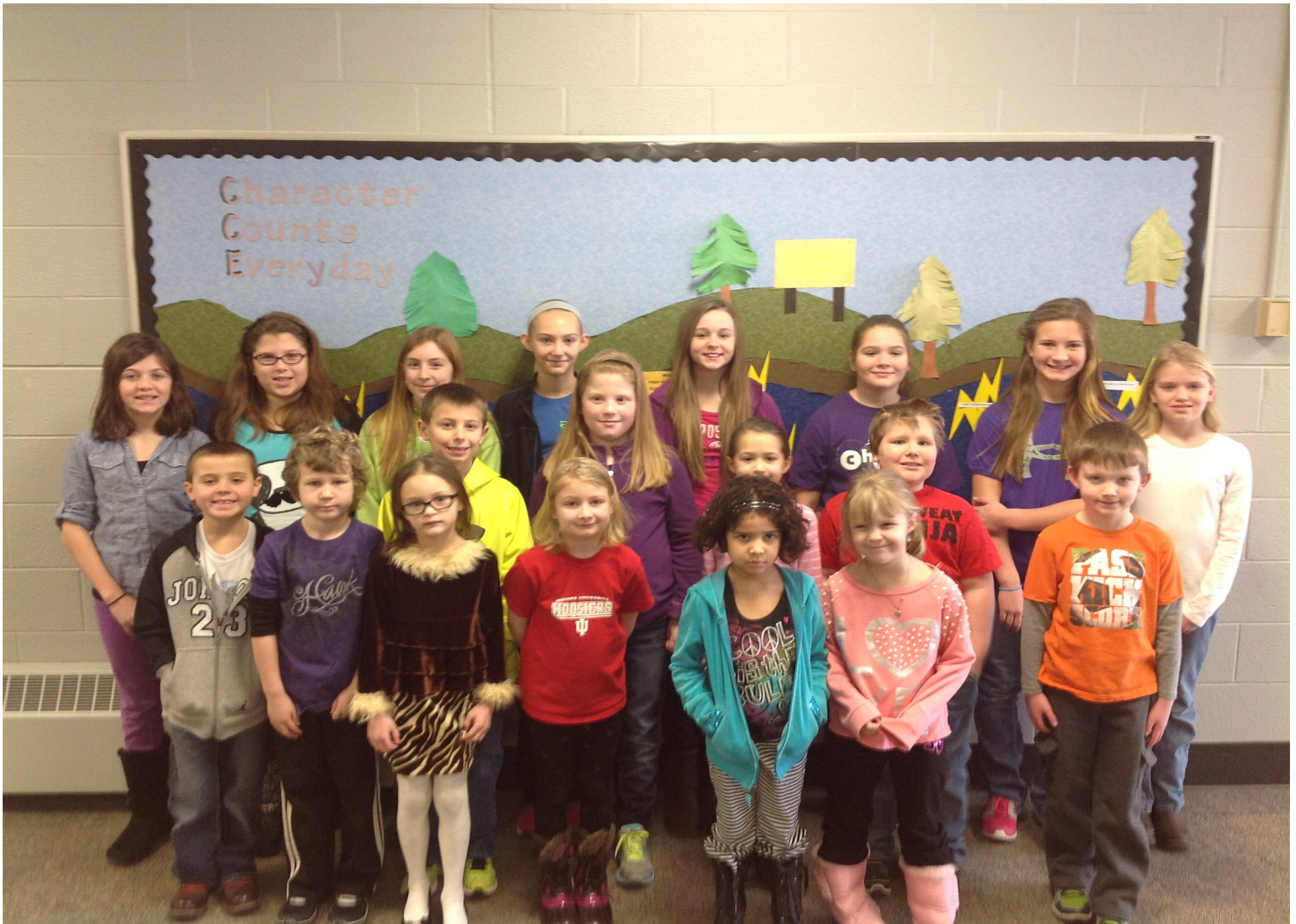
January Character Trait Winners Accountability