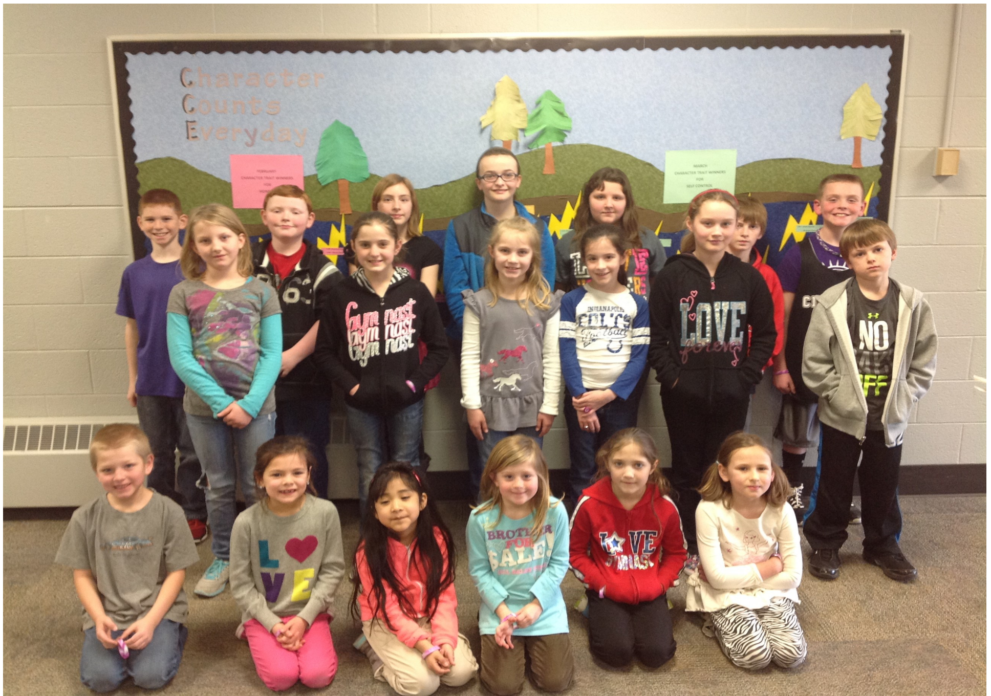
MARCH CHARACTER TRAIT WINNERS SELF-CONTROL