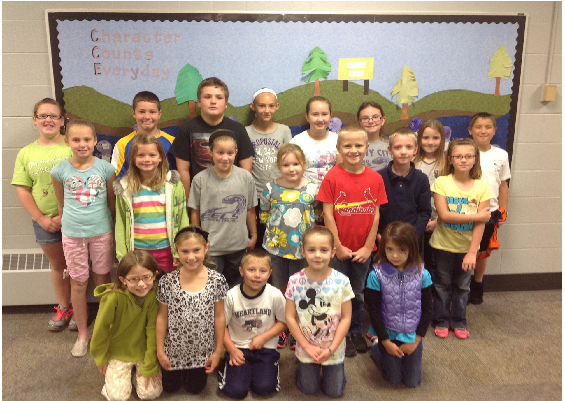
SEPTEMBER CHARACTER TRAIT WINNERS RESPONSIBILITY